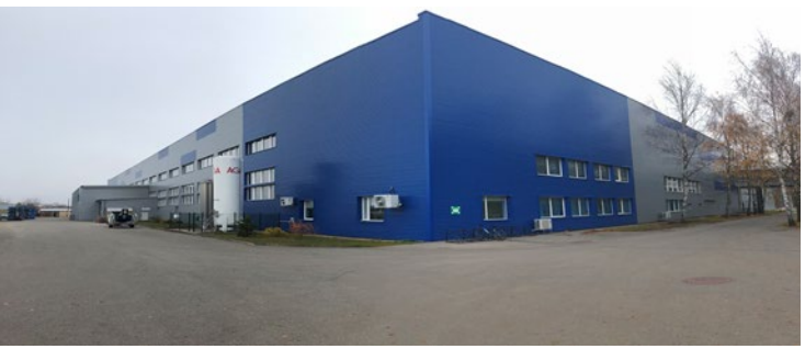
Production building after project implementation

The goal of the project has been fully achieved, namely, significantly improved the company's energy efficiency for the heating of the production building and the production process. Within the project, in accordance with the recommendations of the company's energy audit, the facade and roof insulation works of the production building were performed and the existing laser cutting equipment was replaced with more energy efficient equipment.